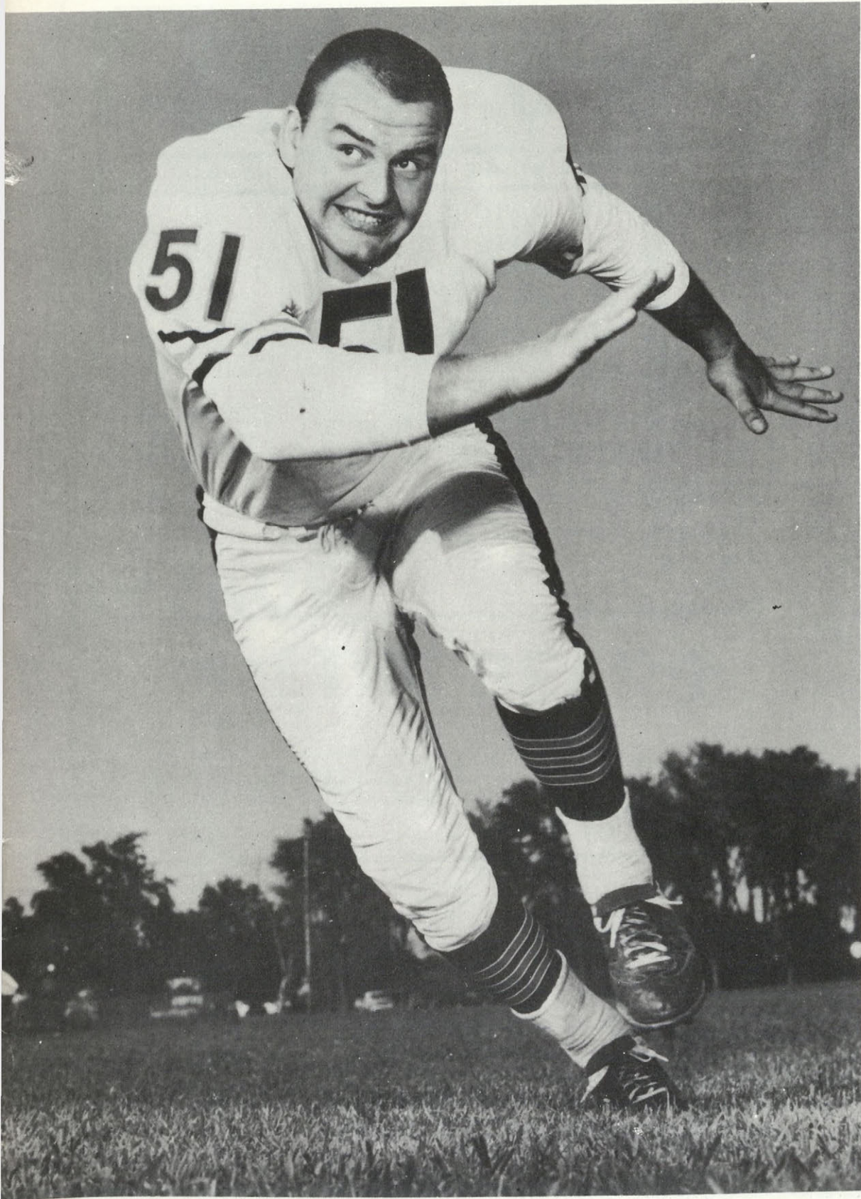
DICK BUTKUS - Pride of Lithuanians and The Chicago Bears