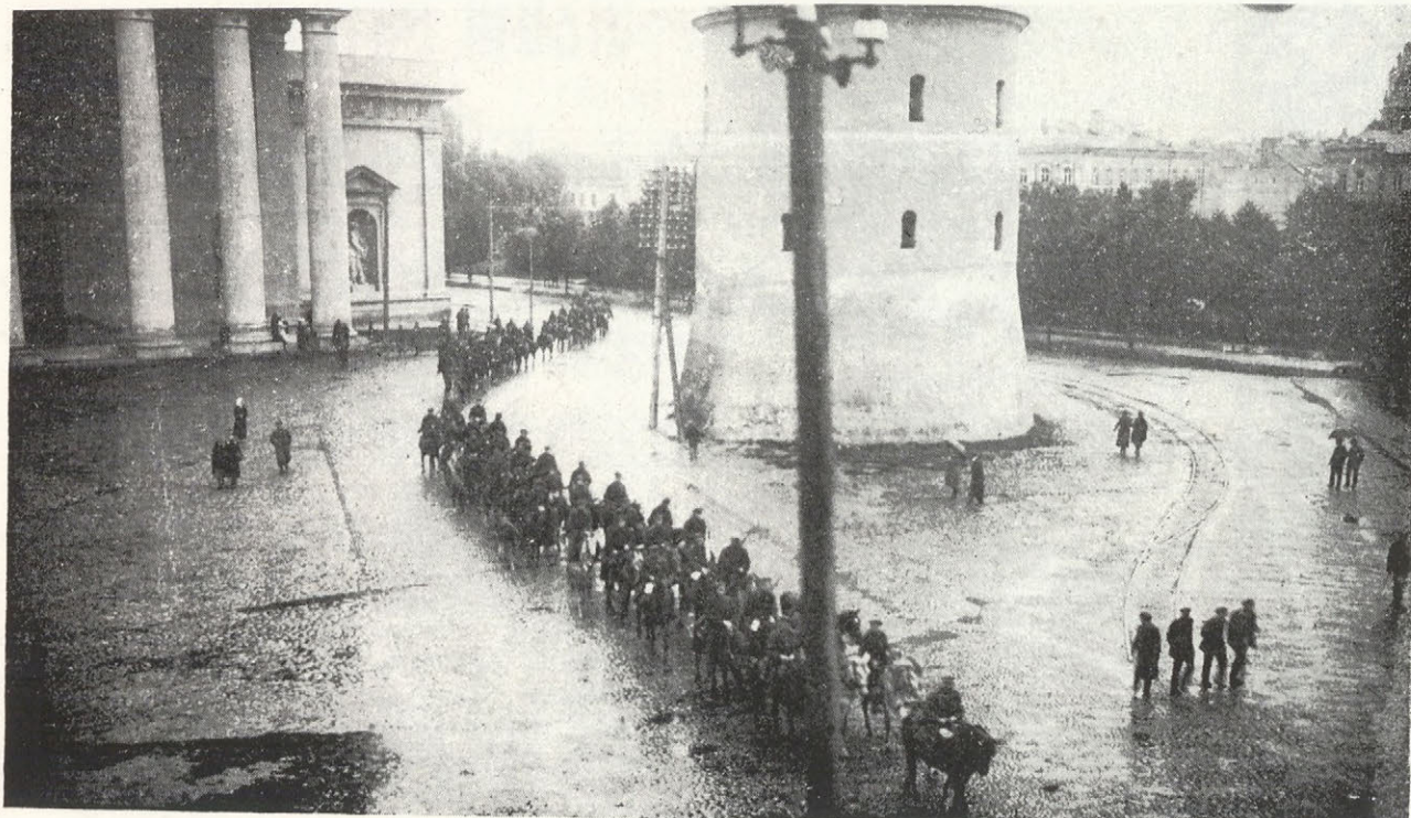
Lietuvos raiteliai Vilniuje 1919 m.