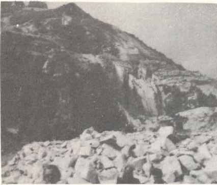
At Italy's Carrarra Marble Mines.

Opera in Rome --- a thrilling experience, a "once in a lifetime" happening. This trip was perfectly planned, packed full of unusual experiences.