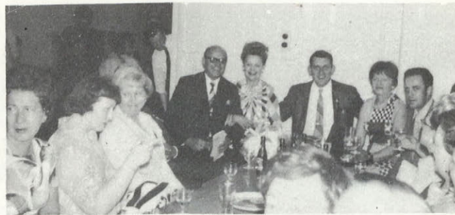
L. Vyčiai Londone Lietuvių klube.