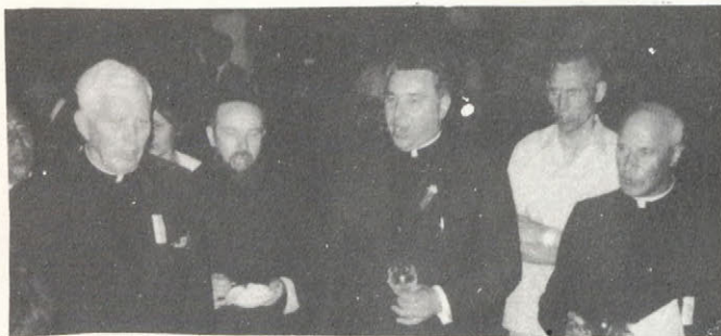
Lietuvių atsisveikinimo vakaras, Romoje.