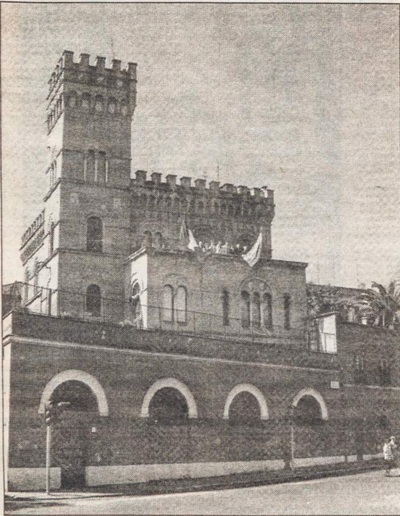
Popiežiškoji Šv. Kazimiero Lietuvių Kolegija Romoje