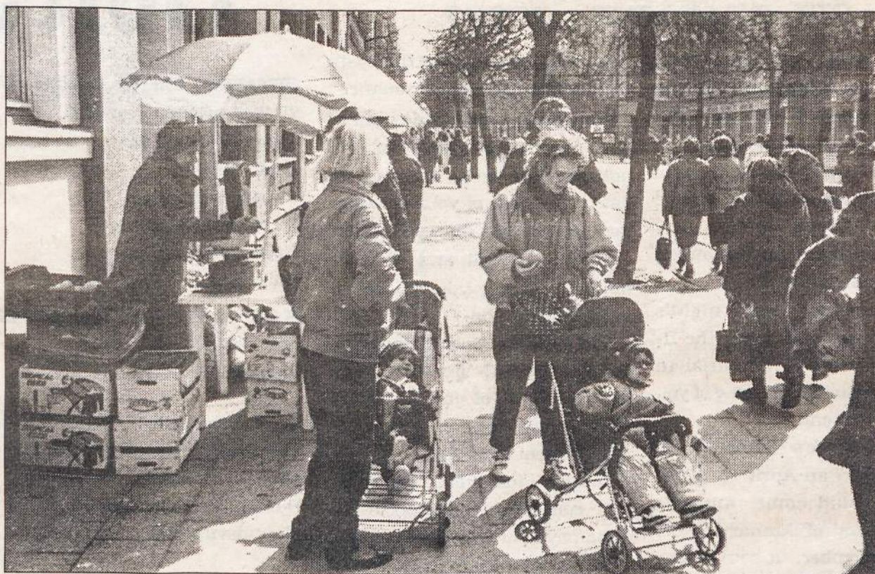
Pavasarinė saulė išviliojo į Vilniaus gatves ne tik prekybininkus, bet ir pirkėjus.