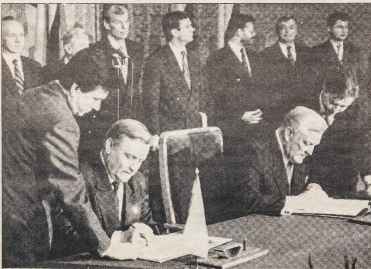
Lenkijos prezidentas Lech Wałęsa ir Lietuvos Prezidentas Algirdas Brazauskas balandžio 26 d. Vilniuje pasirašo Lietuvos ir Lenkijos draugystės ir bendradarbiavimo sutartį.

-- Kintuose, Šilutės r., name, kur 1889-1892 metais mokytojavo ir gyveno filosofas ir rašytojas Vydūnas, įkurdintas jo memorialinis muziejus. Čia taip pat bus meno mokyklos dailės ir muzikos skyriai.