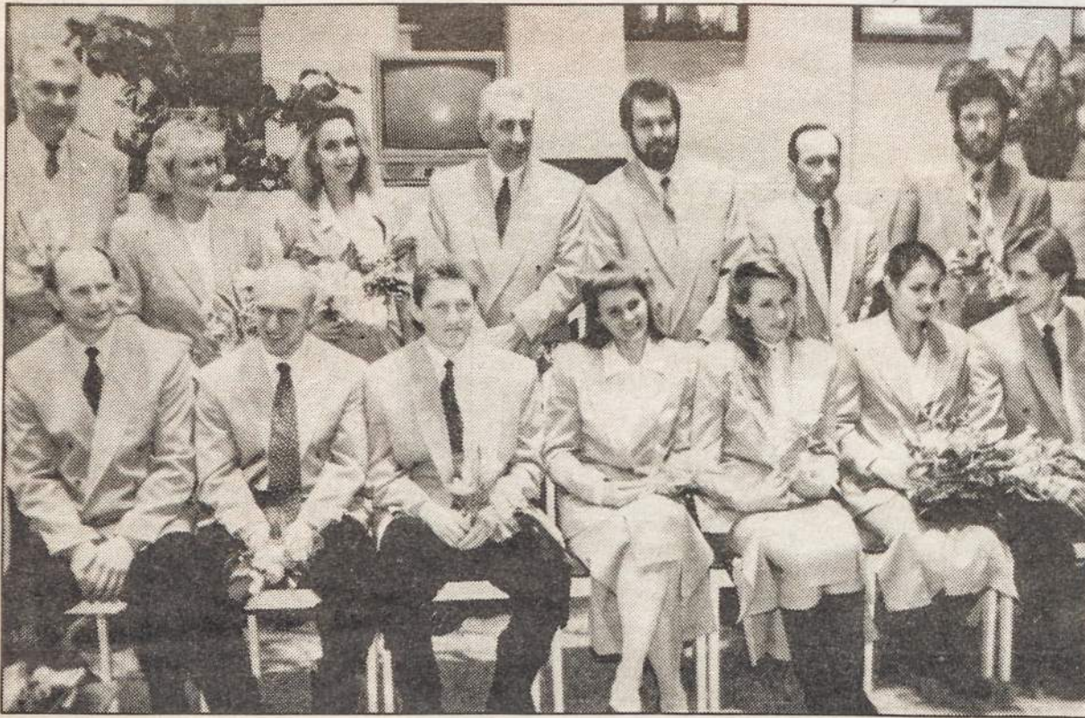
Lietuvos olimpiečiai, išvykę į žiemos olimpinės žaidynes Norvegijoje.