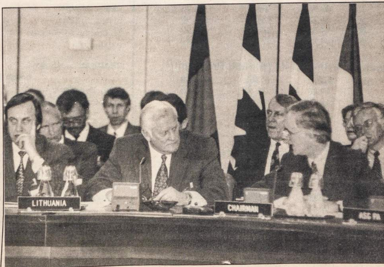
Lietuvos delegacija, pasirašant su NATO "Bendradarbiavimo taikos labui" sutartį. Kairėje — Lietuvos užsienio reikalų ministras Gilys. Centre — prezidentas A. Brazauskas.