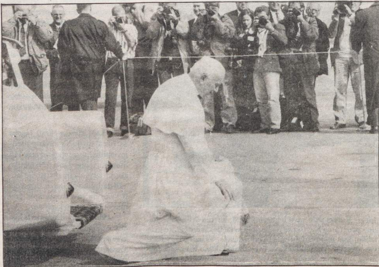
Popiežius Jonas Paulius II, ką tik išlipęs iš lėktuvo, ruošiasi bučiuoti Lietuvos žemę.

Savo pamokslo pabaigoje Šv. Tėvas pasakė: "Krikštu priartėjame prie Kristaus, - prie žmonių ir tautų