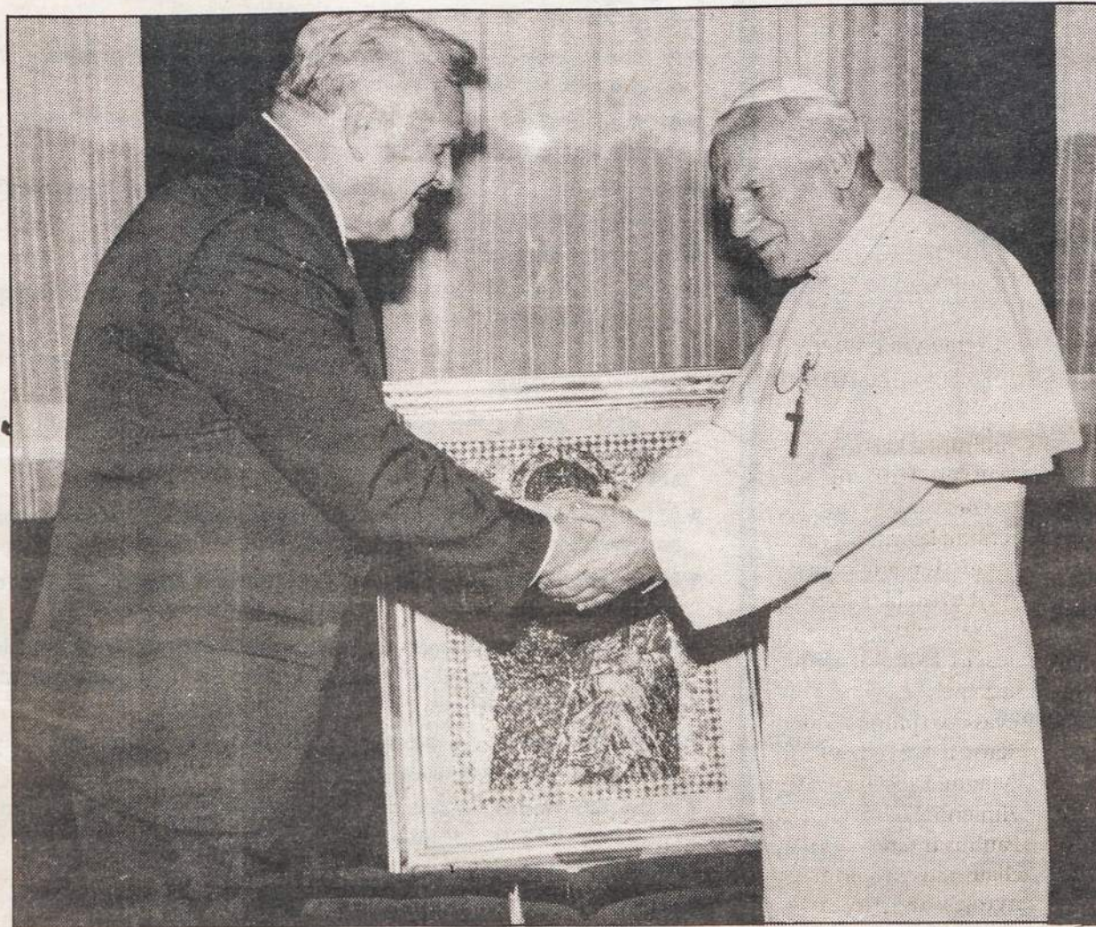
Popiežių Joną Paulių II Vilniuje sveikina Lietuvos Respublikos Prezidentas Algirdas Brazauskas.