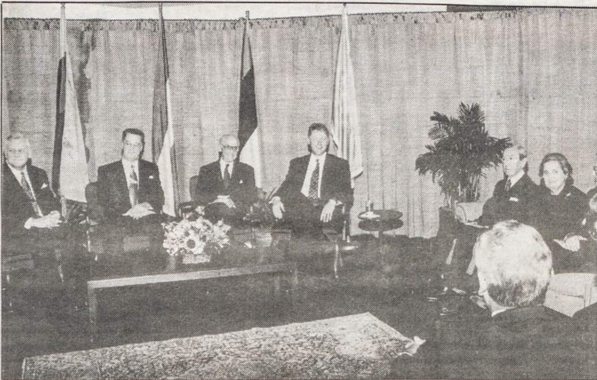
Baltijos valstybių ir JAV prezidentų susitikime JAV misijoje prie JT. Iš k.: Lietuvos Prezidentas A. Brazauskas, Latvijos — G. Ulmanis, Estijos — L. Meri, JAV — B. Clinton, JAV Valstybės dept. sekr. W. Christopher, JAV Ambasadorė M. Albright, JAV Nacionalinės saugumo tarybos atstovas A. Lake.