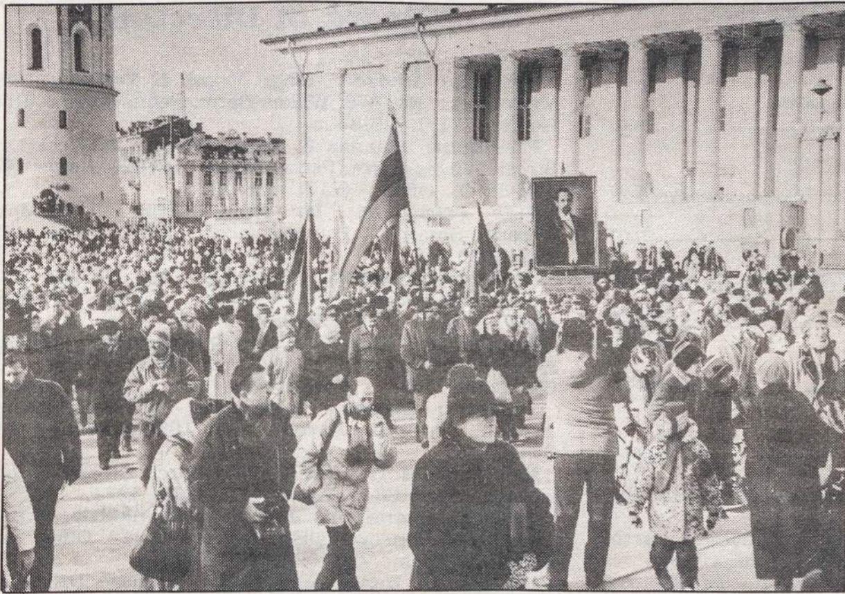
Vaizdas iš demonstracijos, nukreiptos prieš Brazauską ir komunistus, vasario 25 d. tuo metu, kai arkikatedros viduje, Šv. Kazimiero koplyčioje, buvo šventinama Prezidento vėliava. Demonstrantai nešiojo trispalves ir prezidento Smetonos portretą.