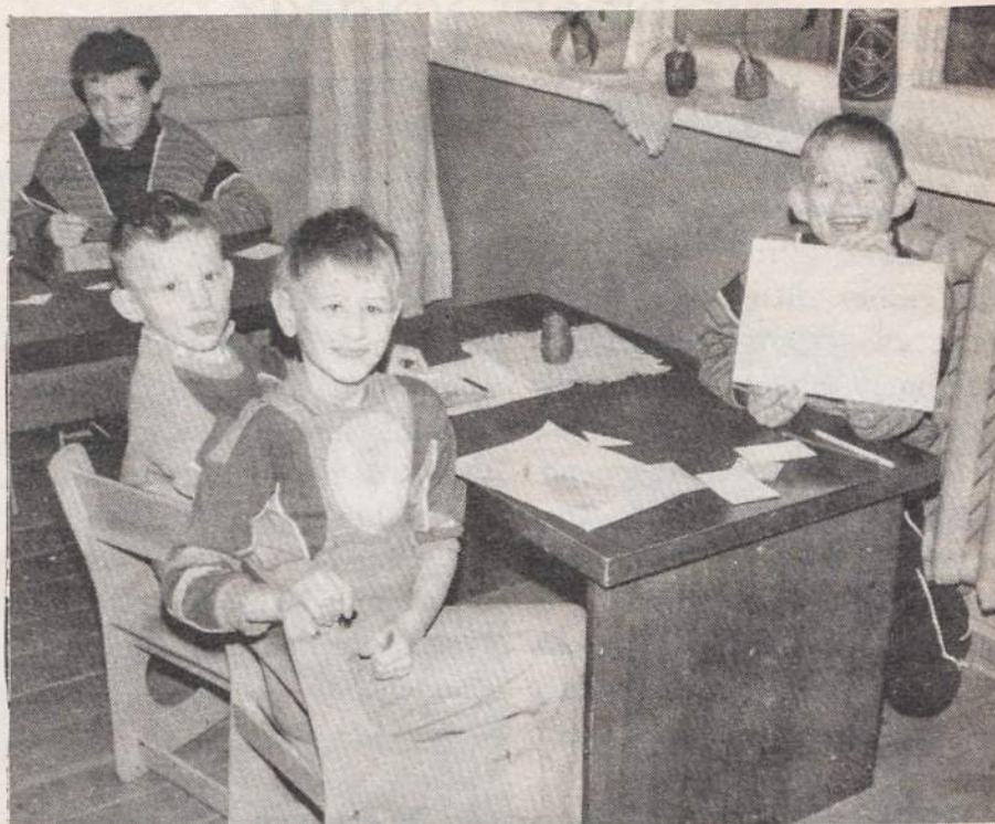
Mentally handicapped children are able to smile because of the assistance they receive through the Christian Children's Fund working along with the Lithuania Children's Fund.

Currently there are 500 Lithuanian children waiting for sponsors. If you would like to sponsor a Lithuanian child or make a donation to assist children in need, call 1-800-776-6767.