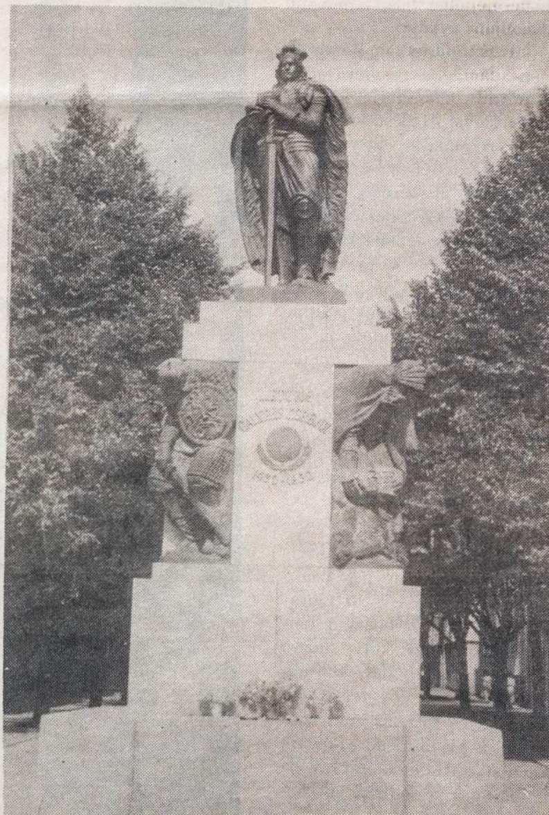
Kaune, Laisvės alėjoje, paminklas Vytautui Didžiajam. Ant paminklo užrašyta: "Lietuvos galybės kūrėjui. (1430-1930).

— Dzūkijoje , miškingiausioje Lietuvos krašte, kuriasi privačios firmos, superkančios miško gėrybes. Ypač perkami grybai — vien tik voveraičių kasdien superkama po 1-3 tonas. Už voveraičių kilogramą mokama po 8-10 Vokietijos markių, nes daugiausia grybų gabenama į Vokietiją.