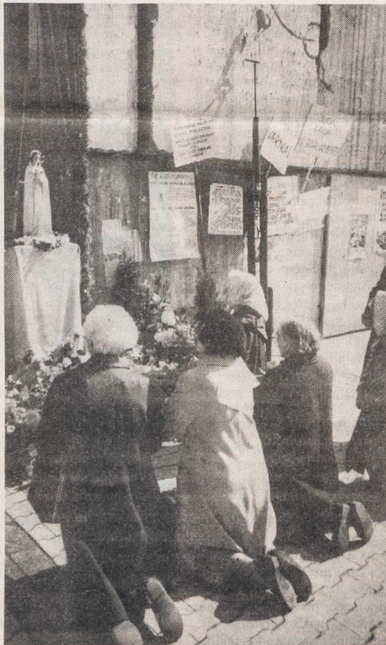
Vilniuje, šalia barikadų į Parlamentą, prie Marijos altoriaus vis dar meldžiasi žmonės už laisvą Lietuvą.