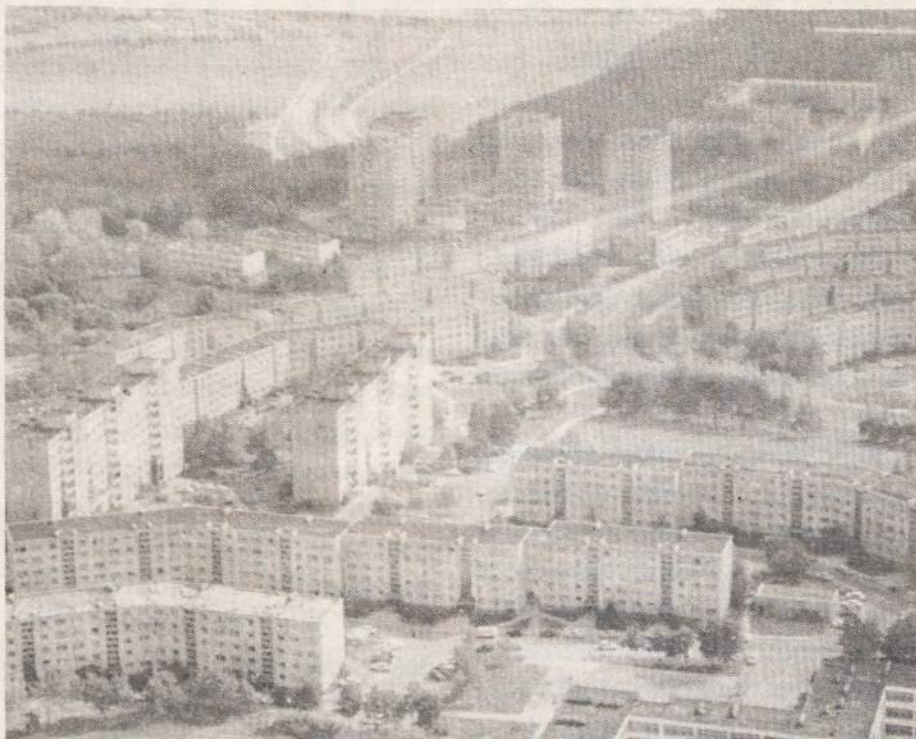
Once a beautiful city of private buildings, Vilnius, the capital of Lithuania seen from the TV tower is row after row of high rise apartment buildings.