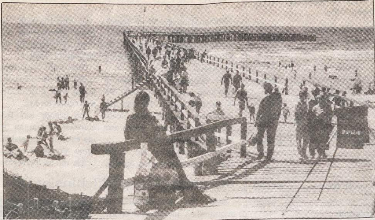
Prie Palangos tilto 1992 m. vasarą.