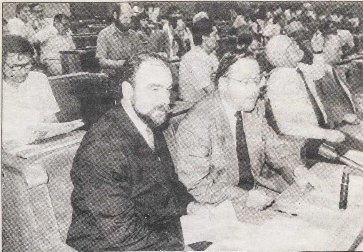
Naujasis Lietuvos Respublikos premjeras Aleksandras Abišala ir Aukščiausiosios Tarybos pirmininkas Vytautas Landsbergis parlamente.