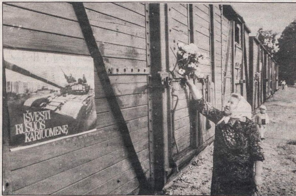
Biržuose minint birželio išvežimus, prekybiniai vagonai papuošiami gėlėmis ir plakatais, reikalaujančiais rusų kariuomenės išvežimo.