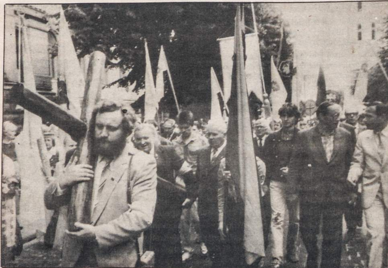
Žygyje į Kryžių kalną dėl laisvėjančios Lietuvos.