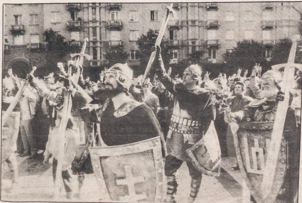
Tokie „savanoriai“ saugo Lietuvos Aukščiausios Tarybos būstinę nuo sovietinių užpuolikų.