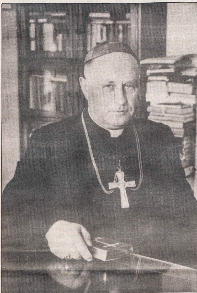
Arkivyskupas Liudas Povilonis