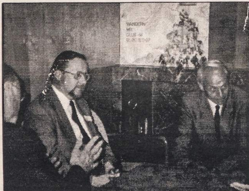
Lietuvos AT tarybos pirm. V. Landsbergis pokalby su Šveicarijos Federacijos buv. prezidentu Rudolf Friedrich.

— Nepaisant blokados atšaukimo Lietuva gali likti be kuro. Tokia informacija ateina iš didžiulės alyvos perdirbimo įmonės Mažeikiuose. Nors naftos yra apdirbama daug, tačiau problema yra su transportacija. Nėra specialių geležinkelio vagonų, skirtų alyvos pervežimui. Mažeikiuose naftos pagaminama tiek, kad jai išvežti per parą reikia 650 vagonų, o jų gaunama tik 450.