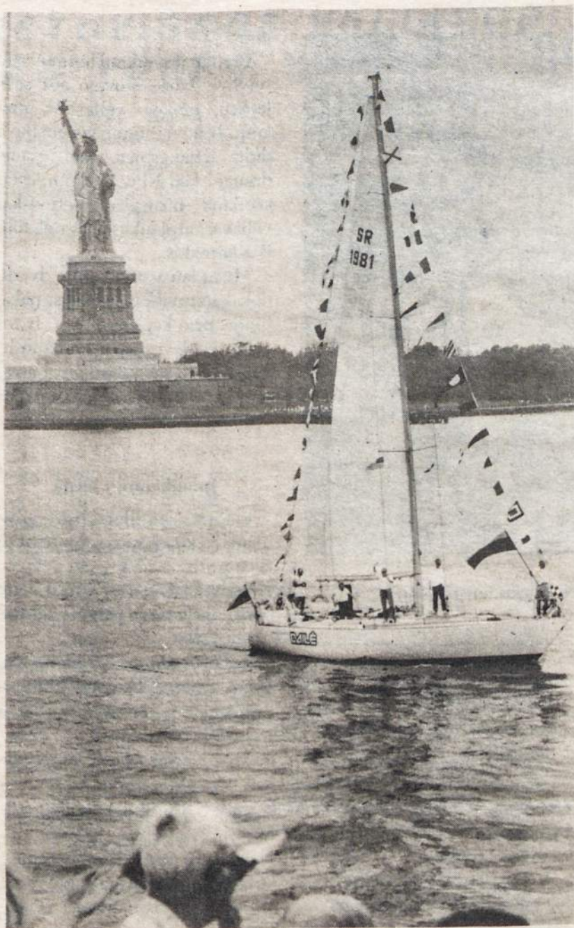
Jachta "Dailė" prie Amerikos Laisvės statulos. Jūreivis ant jachtos galo dešinėje mosuoja lietuviška vėliava.