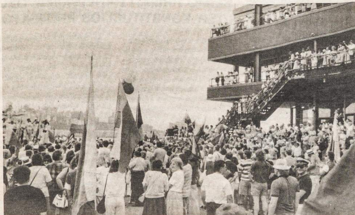
Žmonių minia su lietuviškomis vėliavomis jachtų sutikime New Yorko uoste.