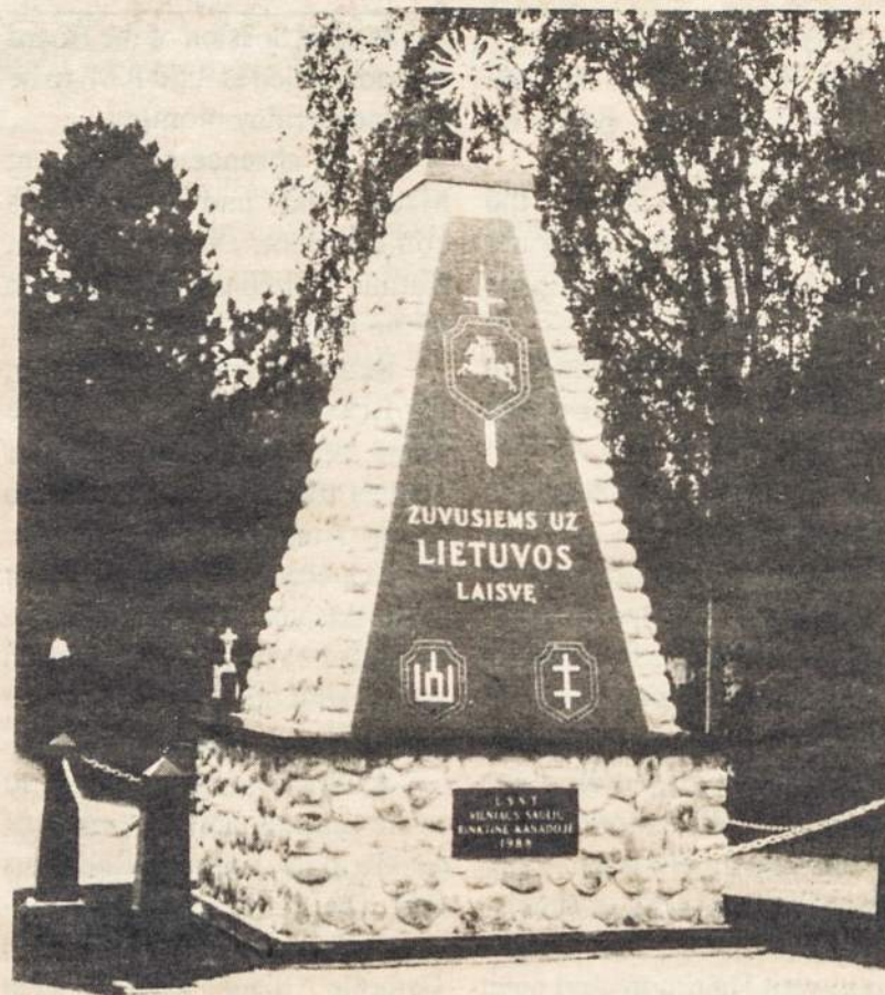
Paminklas žuvusiems dėl Lietuvos laisvės Šv. Jono lietuvių kapinėse Mississauga, Ontario, Canada. Paminklą pastatė Lietuvos Šaulių Sąjungos Tremtyje Vilniaus šaulių rinktinė Kanadoje. Paminklo atidengimas ir pašventinimas įvyko š. m. gegužės 29 d.

Pagrindinė, svarbiausioji seimo pranešimų ir diskusijų tema buvo nuolat besikeičianti padėtis okupuotoje Lietuvoje ir jos reikšmė tautiečiams tėvynėje