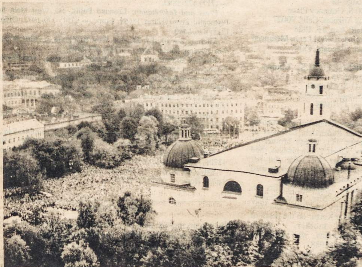
Daugybė žmonių su lietuviškomis vėliavomis susirinko į vėliavos pakėlimo iškilmes. Lietuviška vėliava Gedimino pilies bokšte Vilniuje pakelta spalio 7 d.

tiems vengrų pabėgėliams pagelbėti. Tame pat laiške kongr. Feighan pažymi, kad prieš 30 metų Vengrijoje buvo nužudyta apie 2,000 sukilėlių — laisvės kovotojų ir iki šiol jų giminėms neleidžiama atrasti artimųjų lafonus ir juos deramai palaidoti. Tą reikalą kongresmanai dabar priminė naujajam Vengrijos ministerei Karoly Grosz.