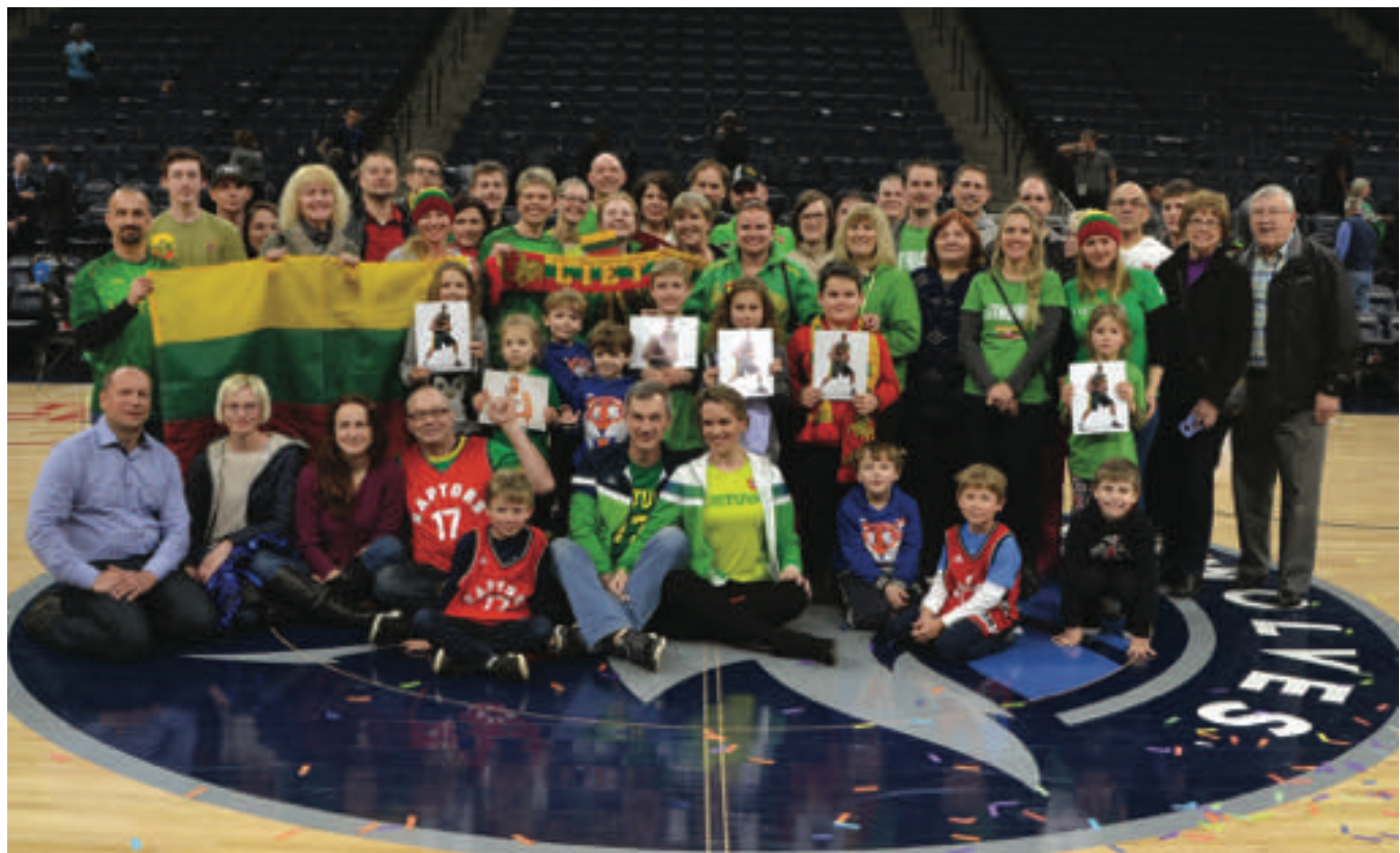
Sports fans during Minnesota's Timberwolves versus Toronto's Raptors game. Lithuanian Jonas Valančiūnas plays for the Raptors.