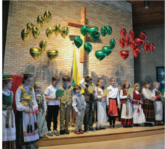
Celebrating Lithuania's independence.

Our Fall Fest event, held in October is dedicated to our annual fundraising efforts. We organize a raffle, a silent auction and other fun activities to encourage donations. During the evening, school children and the choir "Šiaurinė" put together a music program, and a home-made Lithuanian meal is served to everyone at the event.