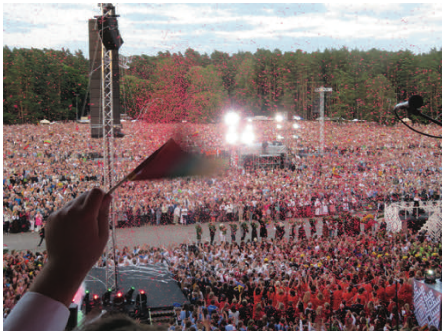
View from the stands: Song Festival.

stands, rain or shine, sitting and standing, stretching their vocal cords, following choral direction from the directors, and some gesture choreography as well. A number of choirs were involved in extra performances. For example, Chicago-based "Dainava" and three other choirs from the diaspora joined the Lithuanian choirs and dancers in Kaunas for the official opening of the Song Festival on June 30th. "Dainava" was also privileged to sing with the