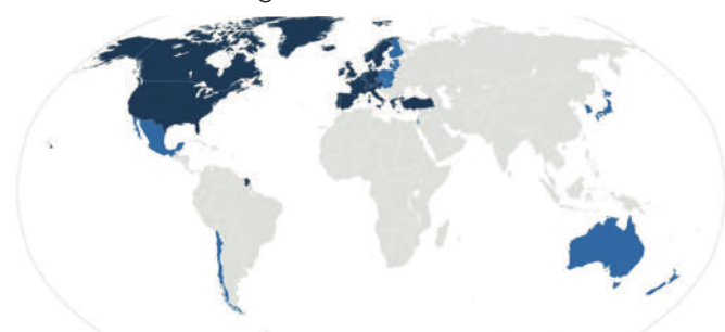
OECD member states.

...Lithuania has officially become a member of Organization for Economic Co-operation and Development (OECD). The OECD Economic Survey of Lithuania praises the economic growth over the past 10 years and the drop in unemployment with stabilization of public finances. It encourages increases in productivity, reduction in income inequality and reduction in emigration and declining population. It noted a mismatch between worker skills and business needs and recommends strengthening work-based learning.