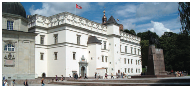
Grand Dukes Palace

...The reconstruction of the Grand Dukes' Palace in Vilnius has been completed after the expenditure of 100 million Euros over a 15 year period. It was built over the remaining ruins of the original palace which was destroyed 200 years ago. The Palace is 13,500 m2 and houses a national museum containing 500,000 items of Lithuanian heritage.