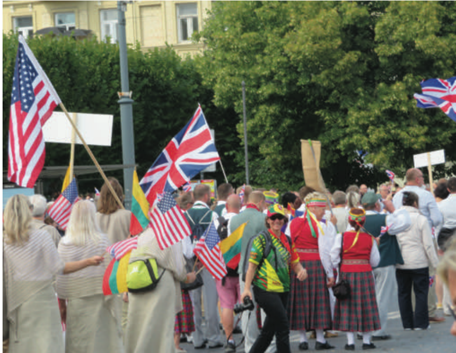
Song Festival scene.