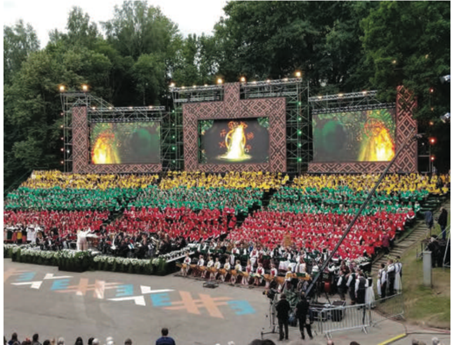
Photo of the Song Festival in Kaunas on June 30.

Like their dancer counterparts, Song Festival attendees practiced for months and months before the festival, had to submit choir "audition" tapes, and prior to Song Day, had two days of practice prior to the event on July 6, King Mindaugas Day. Choir members spent hours in the