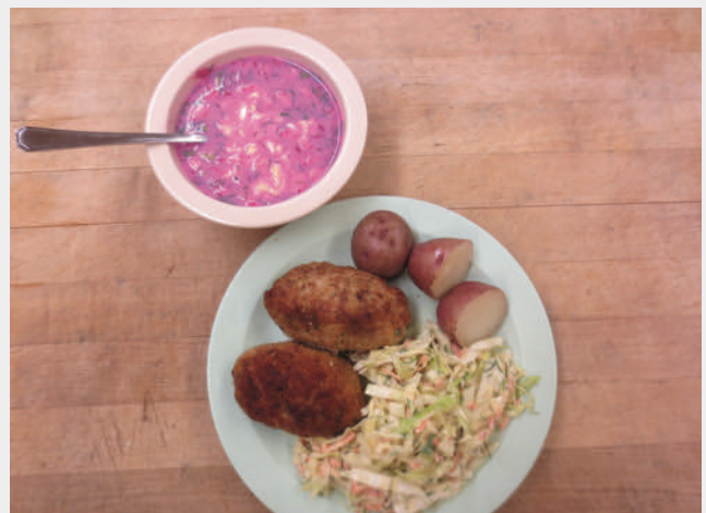
Lunch - saltibarsciai kotletai coleslaw.