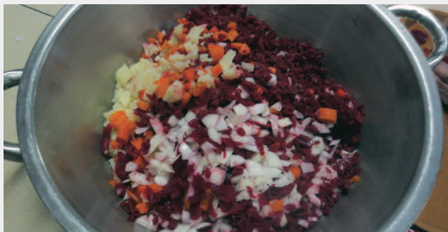
Vinegretas in the works.