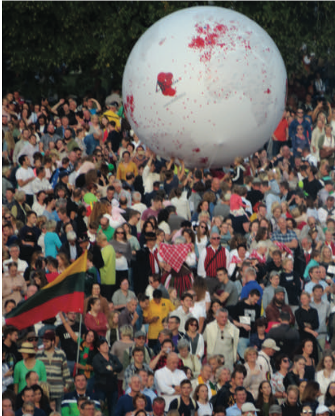
Festival view.

boys' choir „Dagilėlis“ from Šiauliai at a special St. Christopher Festival concert at St. Casimir Church on July 2. With choirs from Vilnius and Raseiniai, they participated in the formal flag-raising the morning of July 6 in front of the Presidential Building, singing the Lithuanian anthem and “Mano kraštas” (My country) by Gytis Paškevičius.