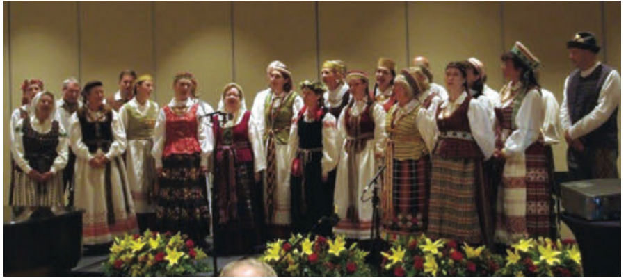
Sodauto Lithuanian Folk Ensemble performed at the K of L gala concert.

After lunch, the second plenary session began with a