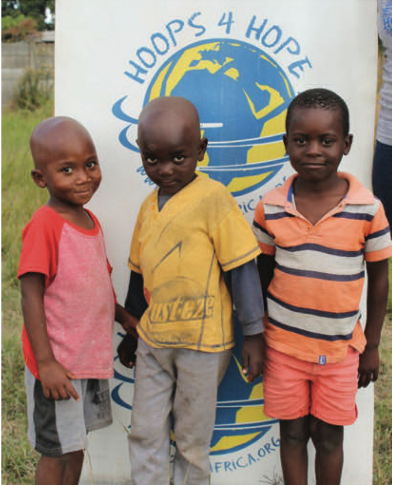
Three young boys smiling for Hoops 4 Hope.