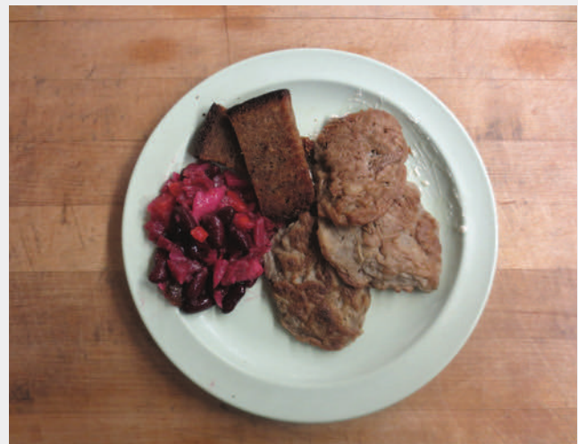
Kepta duona bulviniai blynai and vinegretas.