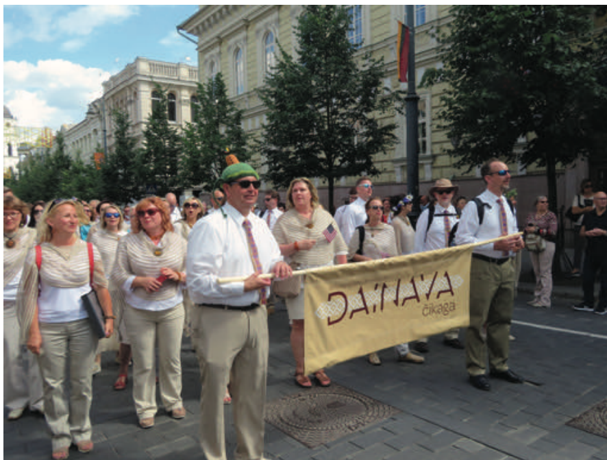
Song Festival scene.

Festival on July 6 in Vilnius. During that week, a mosaic of events was part of the official Song Festival calendar, while other organizations scheduled their events accordingly (so they didn't conflict wherever possible).