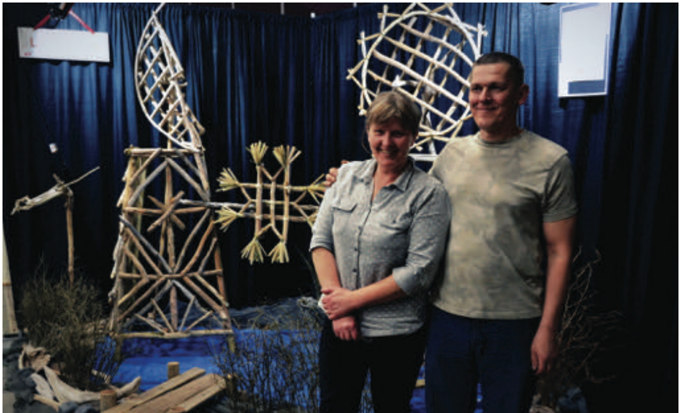
Lithuanians participate in the Festival of Nations in Minnesota.