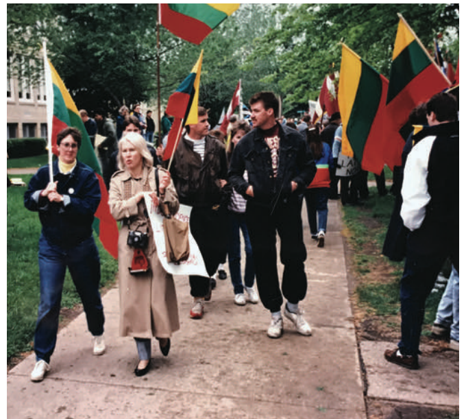
When the Gorbachevs arrived in Minneapolis on June 3, 1990, the crowds included protestors. Most were Latvians, Lithuanians, and Ukrainians holding national flags and signs. The Lithuanian World Community from Cincinnati praised Gorbachev for his "heroic pursuit of democracy and freedom" and asked him to reverse Stalin's illegal annexation of Lithuania.

In addition, a small group of women started teaching Lithuanian language during Sunday church service. This informal study group turned into Martynas Mažvydas Lithuanian Heritage School, which currently has 30 children and 5 adult students and 6 teachers. All teachers are women/mothers from our own community who took