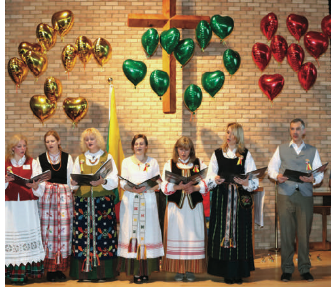
The Šiaurinė choir performs during the celebration of Lithuania's independence.