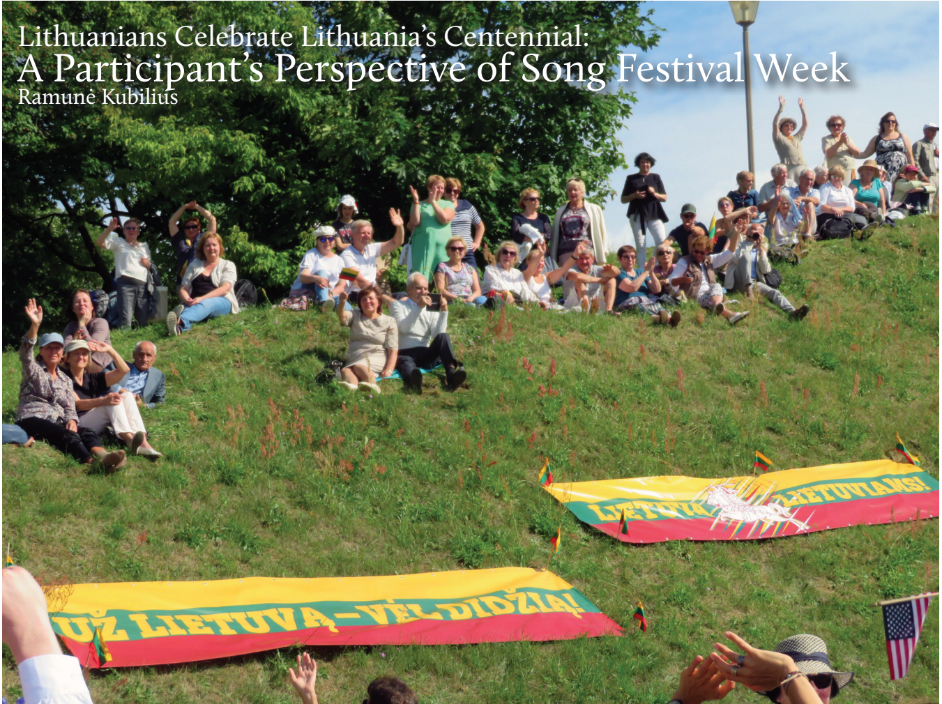
View from the procession through the streets of Vilnius.