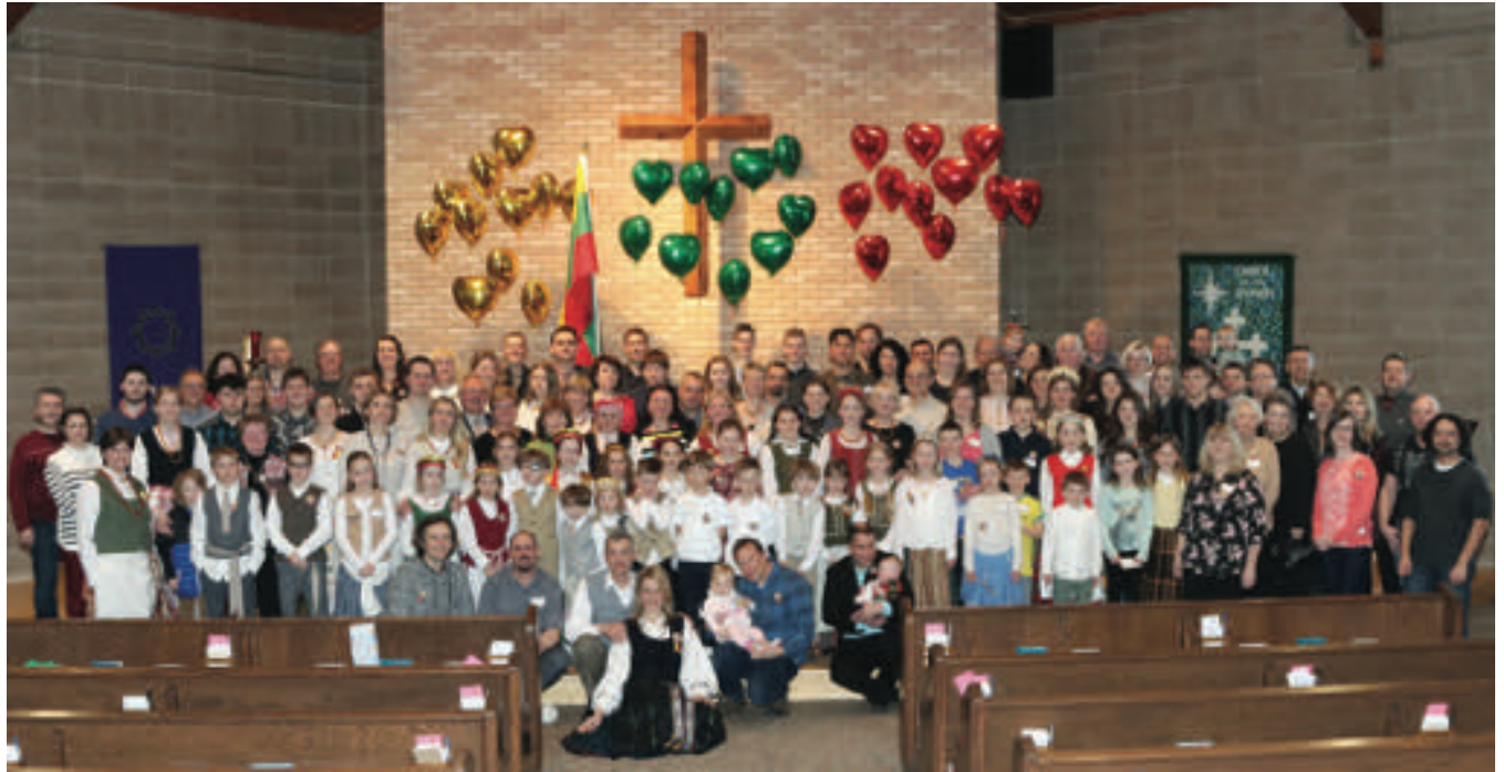
Lithuanians in Minnesota celebrate the 100th Anniversary of Independence.

The Lithuanian American Community of Minnesota was established in 1991 by an active group of Lithuanian Americans, most of whom were born and raised in the United States. This same group of Lithuanian Americans was playing a significant and active role in representing the interests of Lithuania during the times of the Singing Revolution by joining forces with local Latvians and Estonians and protesting Gorbachev's visit to Minnesota.