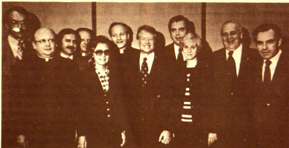
Representatives of Lithuanian American Community, Inc. met with James Carter on October 2, 1976 in Pittsburgh.

The Lithuanian Radio Hour of Worcester can be heard over a five-state area: Massachusetts, Vermont, Rhode Island, New Hampshire, and Connecticut. It covers a 75-mile radius. The program is broadcast twice weekly on Wednesdays from 8-9 P.M. and Saturdays from 5-6 P.M. live, without commercial interruptions over Public Radio WICN (90.C PM) in Worcester. The Program Committee declares as its purpose: "... the keeping alive of a sense of Lithuanianism in the hearts of those of Lithuanian extraction, ... even more critical-